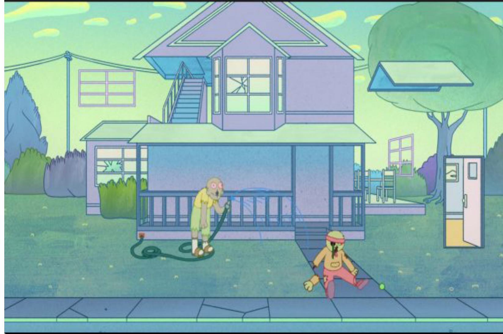
Still of the zombie house in Episode 1.

“I was used to exclusively hand-rendering my work, so I hadn’t really used a wacom tablet before and the show required a very specific digital brush and size, to be used on PSD layered files,” he says. “That was a huge, daunting challenge in the beginning, but I was surprised by how quickly I adjusted to this new process.”